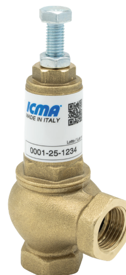
Image for illustrative purposes only. Features may vary from the actual product.